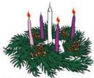
Third Sunday of Advent