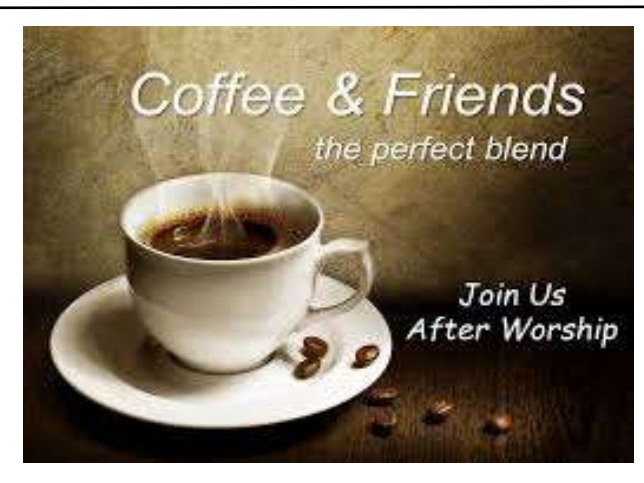
Contact us for a Zoom link!