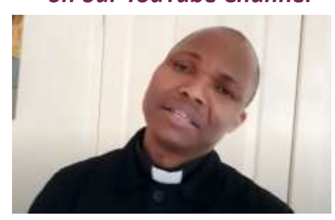
Psalm 23 verse 4 - "A walk with God".